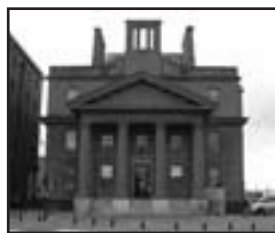
The International Slavery Museum, Liverpool

A number of events will take place around the north west during 2007 to mark the bicentenary of the abolition of the slave trade. To look at some of these opportunities, we have chosen two specific events, the International Slavery Museum in Liverpool and the Revealing Histories: Remembering Slavery events in Manchester.